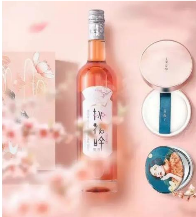
Fig.3 Co-branding gift box of Huaxizi and Luzhou Laojiao (wine)

appearance in the 2020 New York Fashion Week with three cross-border brand products, "Hua xizi × San ze meng × Yang Lu". It took two years for Huaxizi to release her first animation, "Zhang Chang Thrushes", on the Chinese Valentine's Day. It tells the romantic story of his thrushes for her life, combined with traditional Chinese shadow play. The Huaxizi also sponsored variety show to raise awareness, such as the "freshman Diary", "the name of the young" and so on.