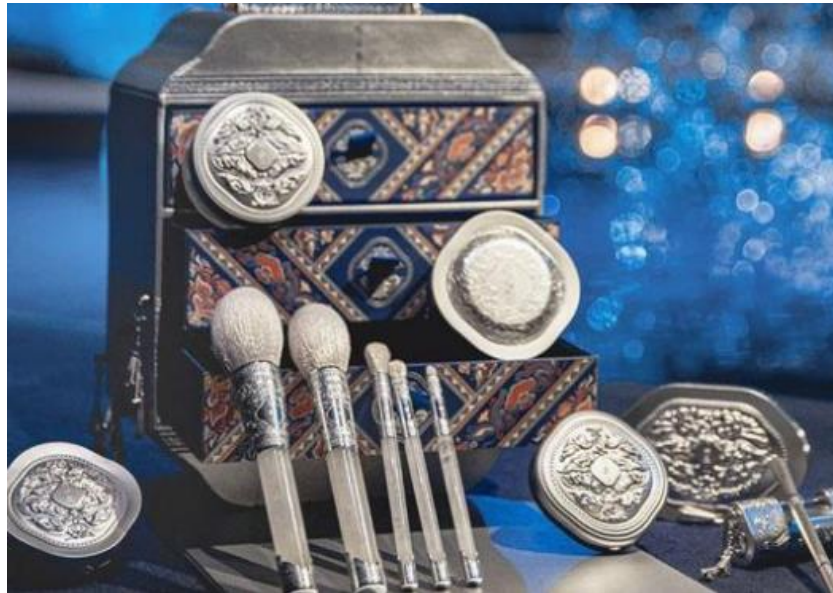
Fig.2 Miao silver (high-end series) gift box of Huaxizi

One of the distinctive elements of the Huaxizi is the use of Chinese elements. For example, in the design and creation of Miao impression (high-end series) makeup, Huaxi integrated Miao embroidery, Miao silver and other elements. In Miao culture, Miao embroidery and Miao silver is not only a symbol of wealth, representing a love and exquisite national art, but also a rare cultural heritage in our country.